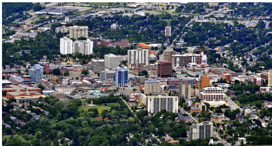
Kitchener, ON - The home of the Lutheran Church-Canada 2017 Convention.